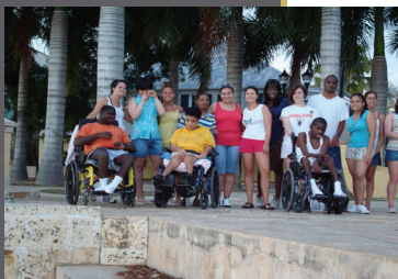
ESU Psychology students volunteering at a human services agency in St. Croix, U.S. Virgin Island.